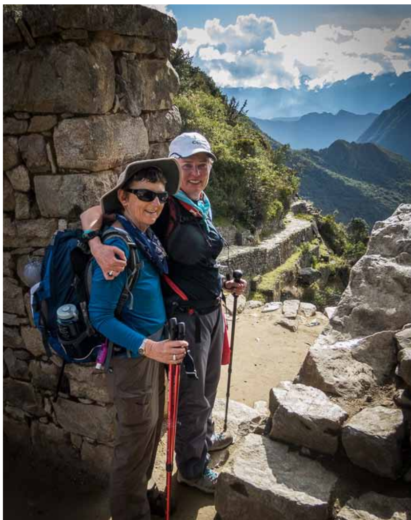
Hikers on the Expedition of Hope to Machu Picchu.

To do this, Ovarian Cancer Canada is refining public outreach and messaging. A new awareness campaign is being prepared for launch in 2015 to connect with more Canadians than ever before. By informing public concern about the disease, the campaign will facilitate the momentum we need to reach key decision makers.