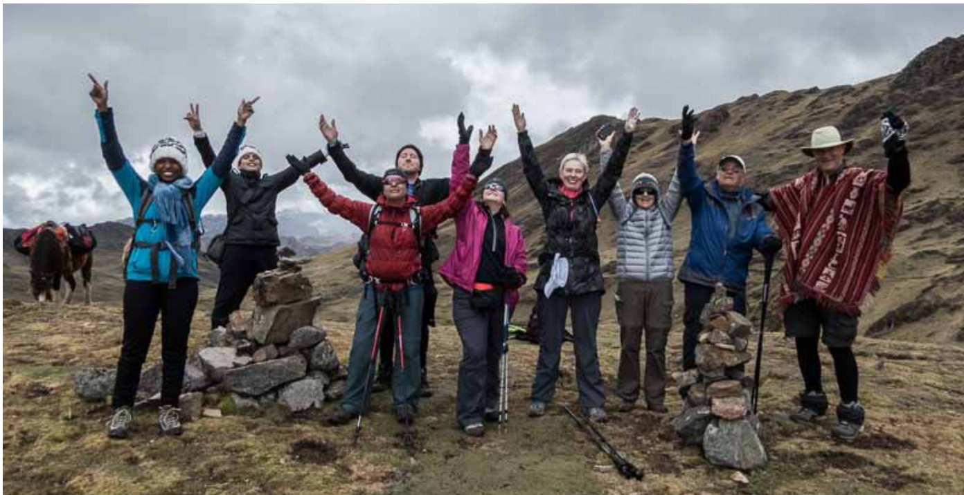
Hikers on the Expedition of Hope to Machu Picchu.

For detailed information, please find audited financial statements online at ovariancanada.org or click here .